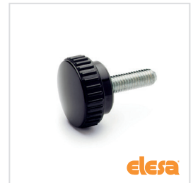
ELESA Original design B.193 p