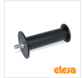
ELESA original design IF / IFF