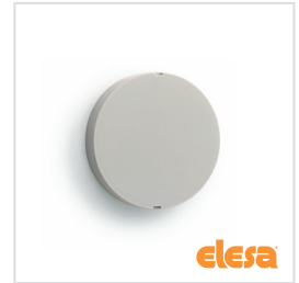
ELESA Original design CP.