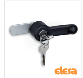
ELESA original design ELCK