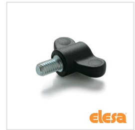
ELESA Original design CWN.p