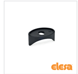
ELESA original design ADT