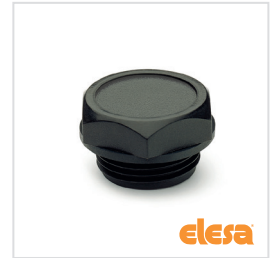
ELESA Original design TN.