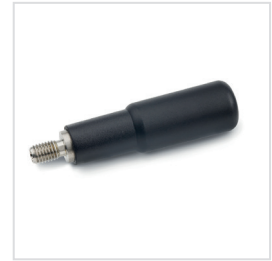
ROSTFREI Inox Stainless Steel