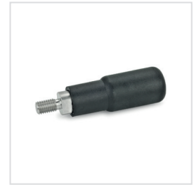
ROSTFREI Inox Stainless Steel