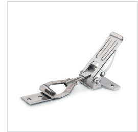
ROSTFREI Inox Stainless Steel